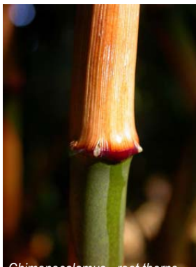
Chimonocalamus - root thorns

Just before and then after the Cultural Revolution, botanists in China from several universities described useful generic names for temperate bamboos. First Yushania was described for spreading bamboos differing from Arundinaria in having longnecked pachymorph rhizomes rather than leptomorph ones. Several other genera with pachymorph rhizomes were described later, all forming clumps. Chimonocalamus was described for species with thorns at the nodes, just like those of the leptomorph-rhizomed Chimonobambusa. These hardened aerial roots develop through the base of the culm sheath in a ring around the node.