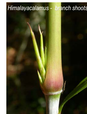
Ampelocalamus has pendulous culm tips, long branches that can scramble through trees, and swollen nodes to catch on tree branches for support.

Two subtropical genera, Drepanostachyum and the larger Himalayacalamus, have multiple branches that break through the culm sheath base, and thin spikelet glumes. The former having open inflorescences, while the latter has condensed ones.